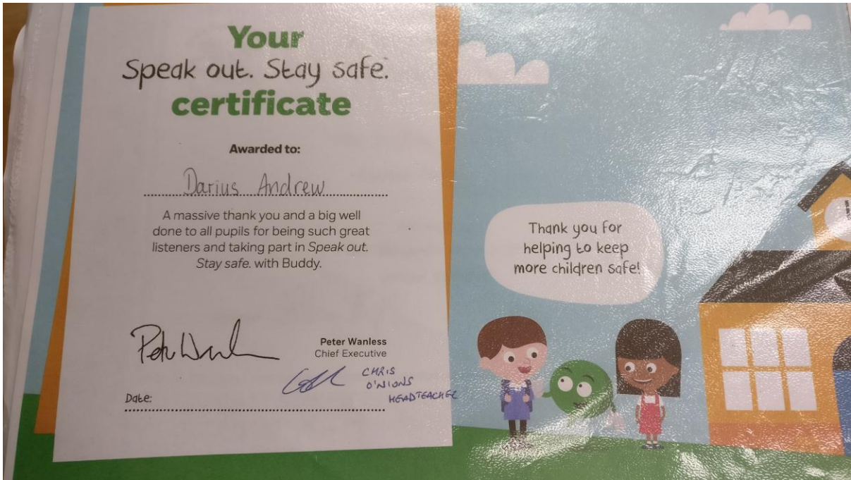
Darius received a certificate for the 'Speak out and stay safe with Buddy' course.