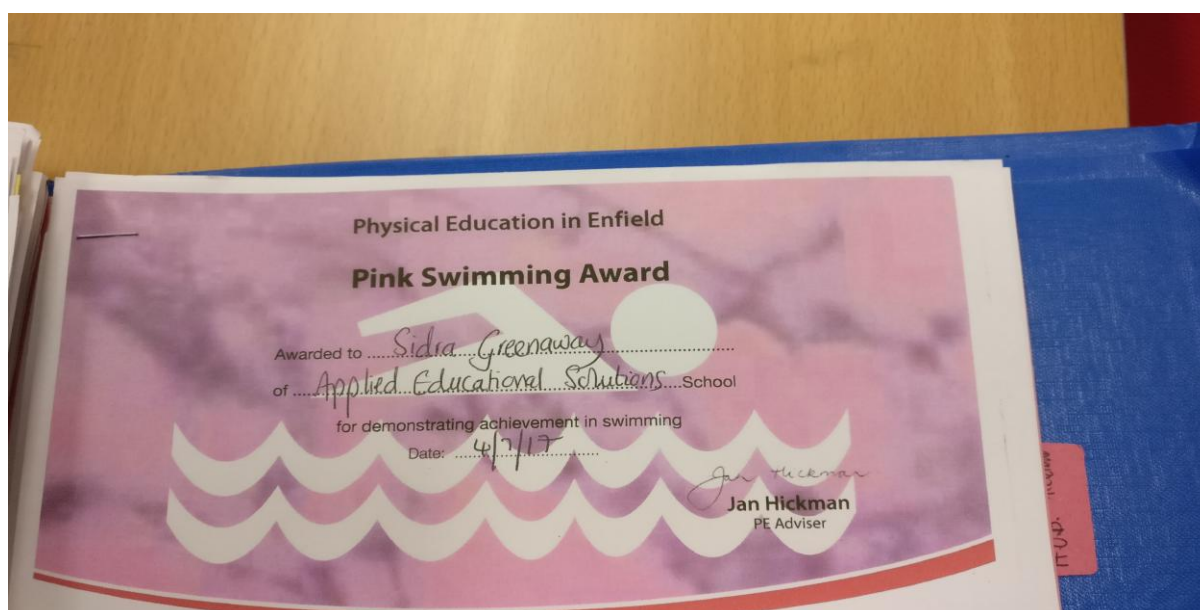
Sidras swimming award