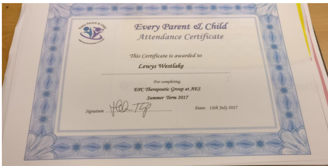
Lewys certificate in Art Therapy

"During the summer term 2017 the students undertook a variety of courses including Essentials of First Aid with the St John's Ambulance, Therapeutic Group intervention work and swimming sessions. These are a selection of the certificates they received. Well done everyone!"