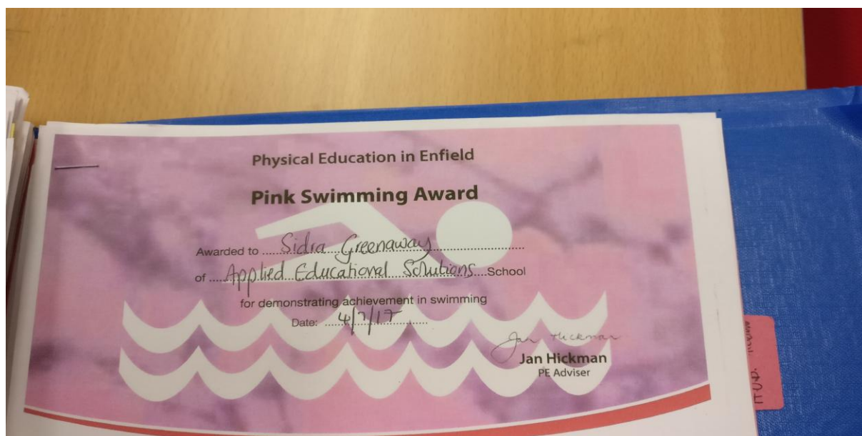
Sidras swimming award