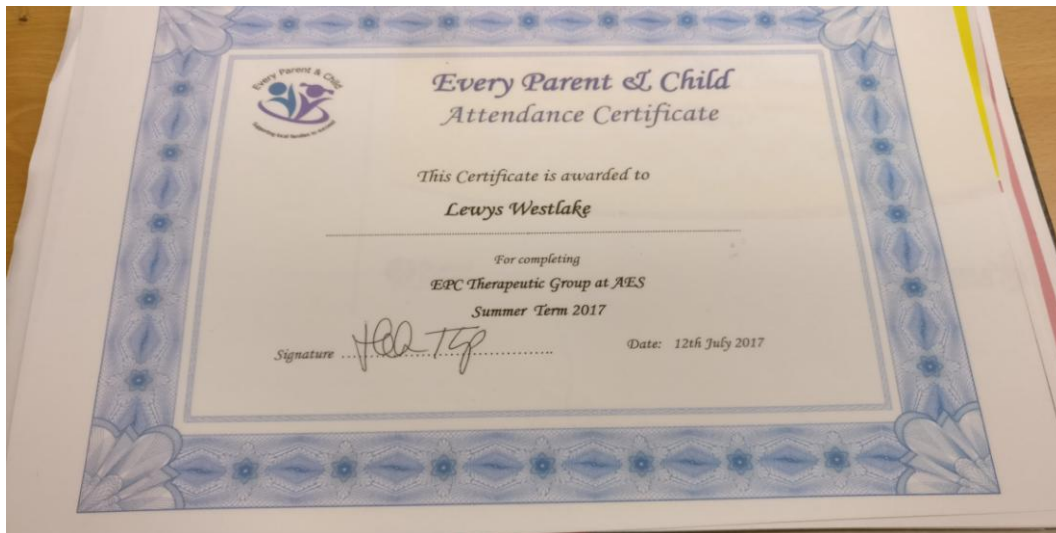
Lewys certificate in Art Therapy

"During the summer term 2017 the students undertook a variety of courses including Essentials of First Aid with the St John's Ambulance, Therapeutic Group intervention work and swimming sessions. These are a selection of the certificates they received. Well done everyone!"